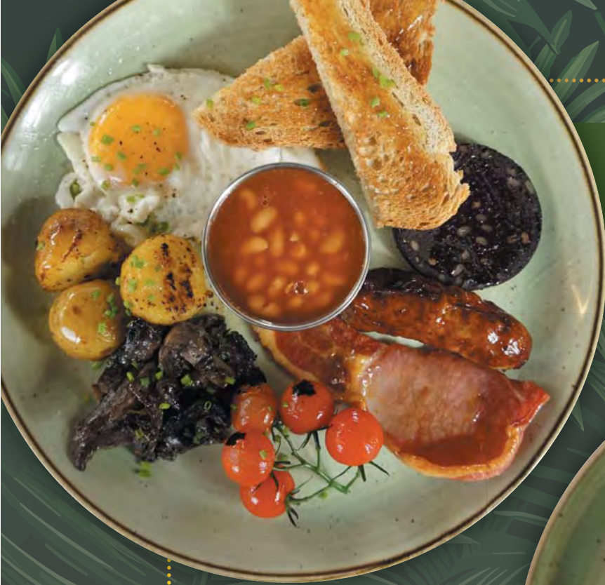
Anabella's Breakfast 10.95