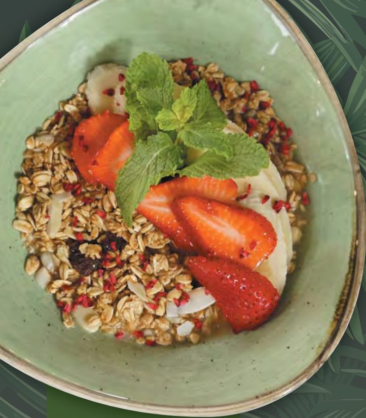
Vegan Granola Parfait 7.50