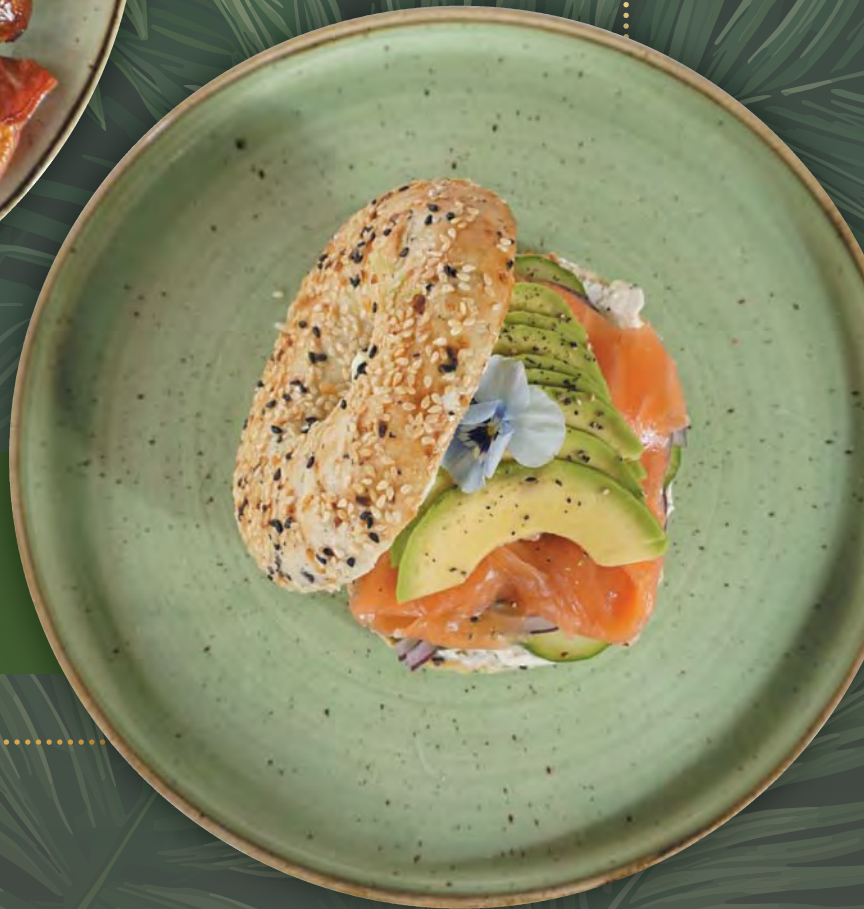
Smoky Salmon Fiesta Bagel 14.50